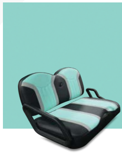
Coastal Blue with color-matched seats