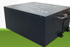
SMART LITHIUM 210Ah