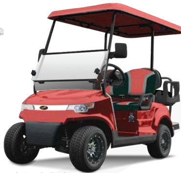
Candy Apple Red