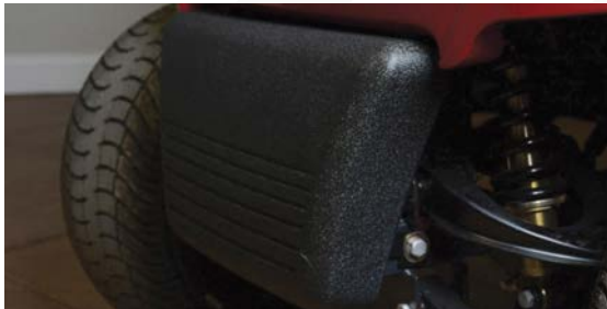
Stylish durable bumper