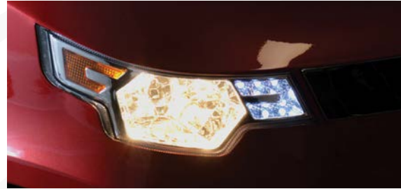
Headlights with integrated turn signals