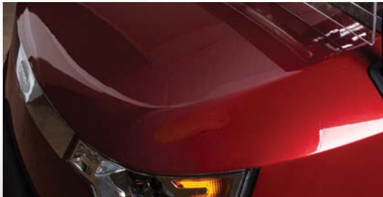
Premium automotive paint and color-matched roof