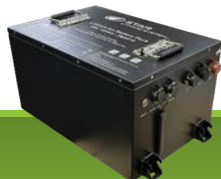
SMART LITHIUM 105Ah