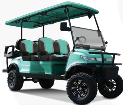
Coastal Blue 4+2 Lifted with color-matched premium seats