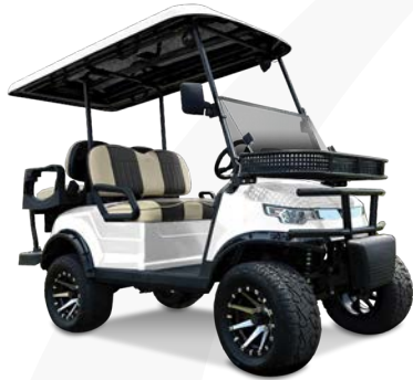
Arctic White 2+2 Lifted with tan and black premium seats

Sure-footed and strong-bodied, the CAPELLA 2+2 LIFTED and CAPELLA 4+2 LIFTED sports an elevated ride height, ready for outdoor romps and off-road adventuring. Compact, yet spacious, and outfitted with all-terrain tires, fender flares, brush guards, bumpers, and baskets, CAPELLA pumps up the fun! In a CAPELLA, even your most challenging outdoor getaway becomes an uplifting experience. Just grab your gear, load up your pals, and head off into the wild. Your next real adventure awaits!