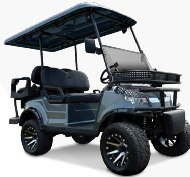
Forest Blue Mist 2+2 Lifted with black premium seats