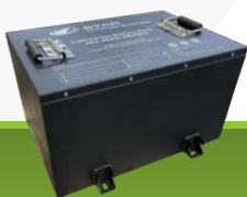
SMART LITHIUM 80Ah

The actual distance you can travel in an electric vehicle is determined by the load you put on the electric motor. Larger and heavier cars will use more energy. Lifted vehicles will use more energy because of the additional weight and larger tires. Adding passengers and uneven terrain will increase the load on the motor. The opposite is true as well. If you lighten the load on the vehicle, it will travel farther. The following ranges are based on a 2-passenger vehicle traveling on flat ground.