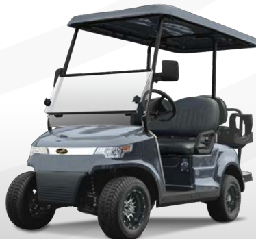
Forest Blue Mist