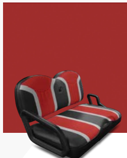
Candy Apple Red with color-matched seats