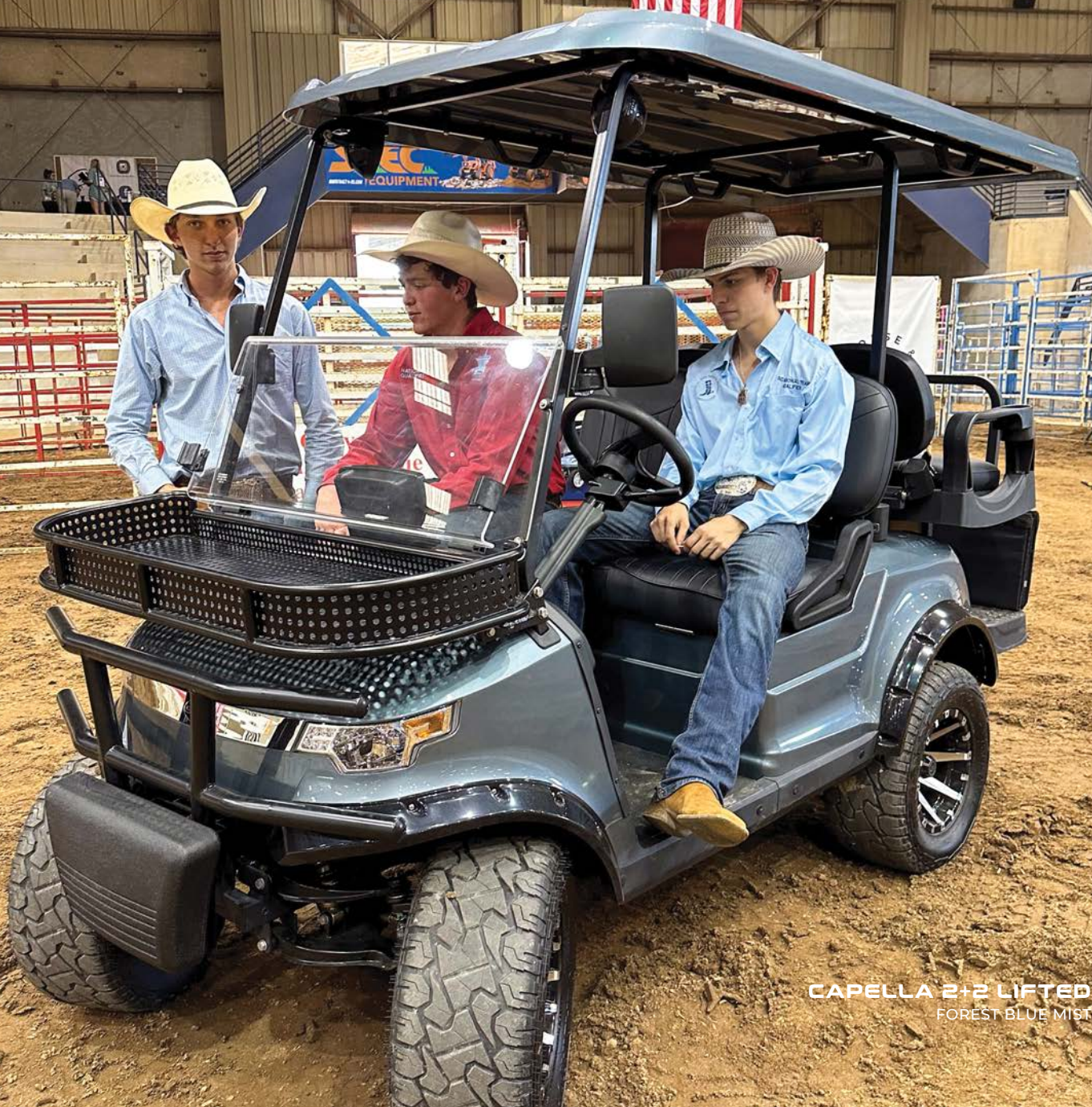
CAPELLA 2+2 LIFTED FOREST-BLUE MIST