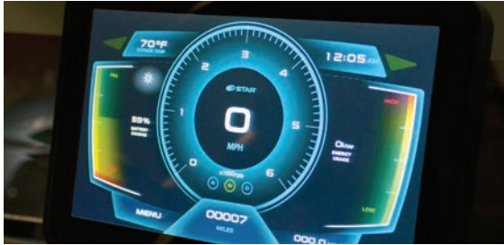
Digital display with turn indicators