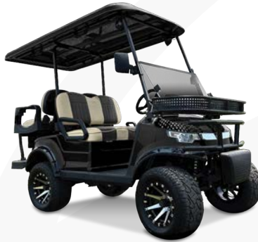
Jet Black 2+2 Lifted with tan and black premium seats