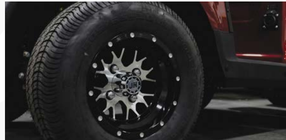
Stylish standard rims and tires