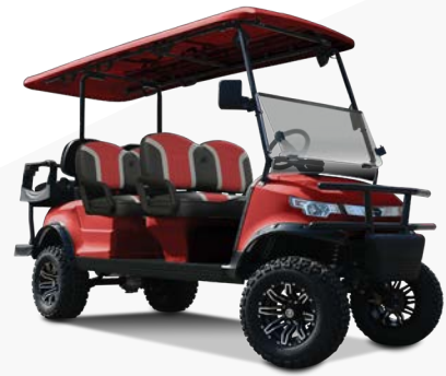
Candy Apple Red 4+2 Lifted with color-matched premium seats