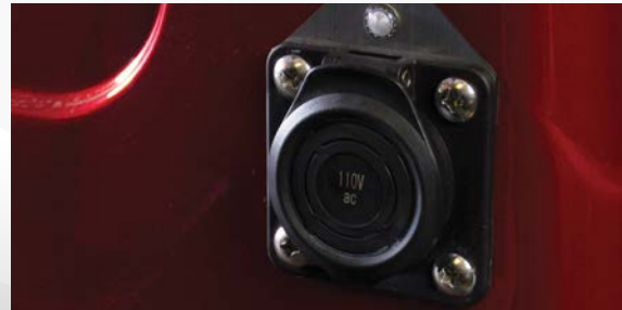
On-board charger and tri-color indicator