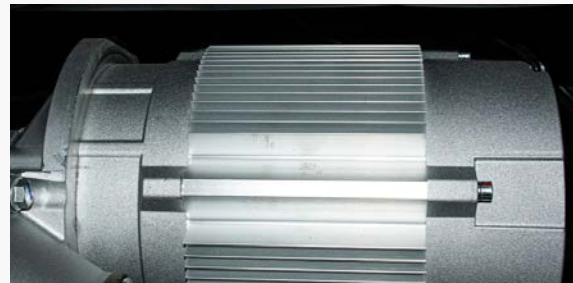
QDS™ Quiet Drive System with temperature protection