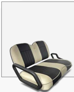
Arctic White with tan and black premium seats