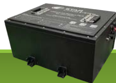
SMART LITHIUM 160Ah