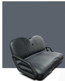
Forest Blue Mist with black premium seats